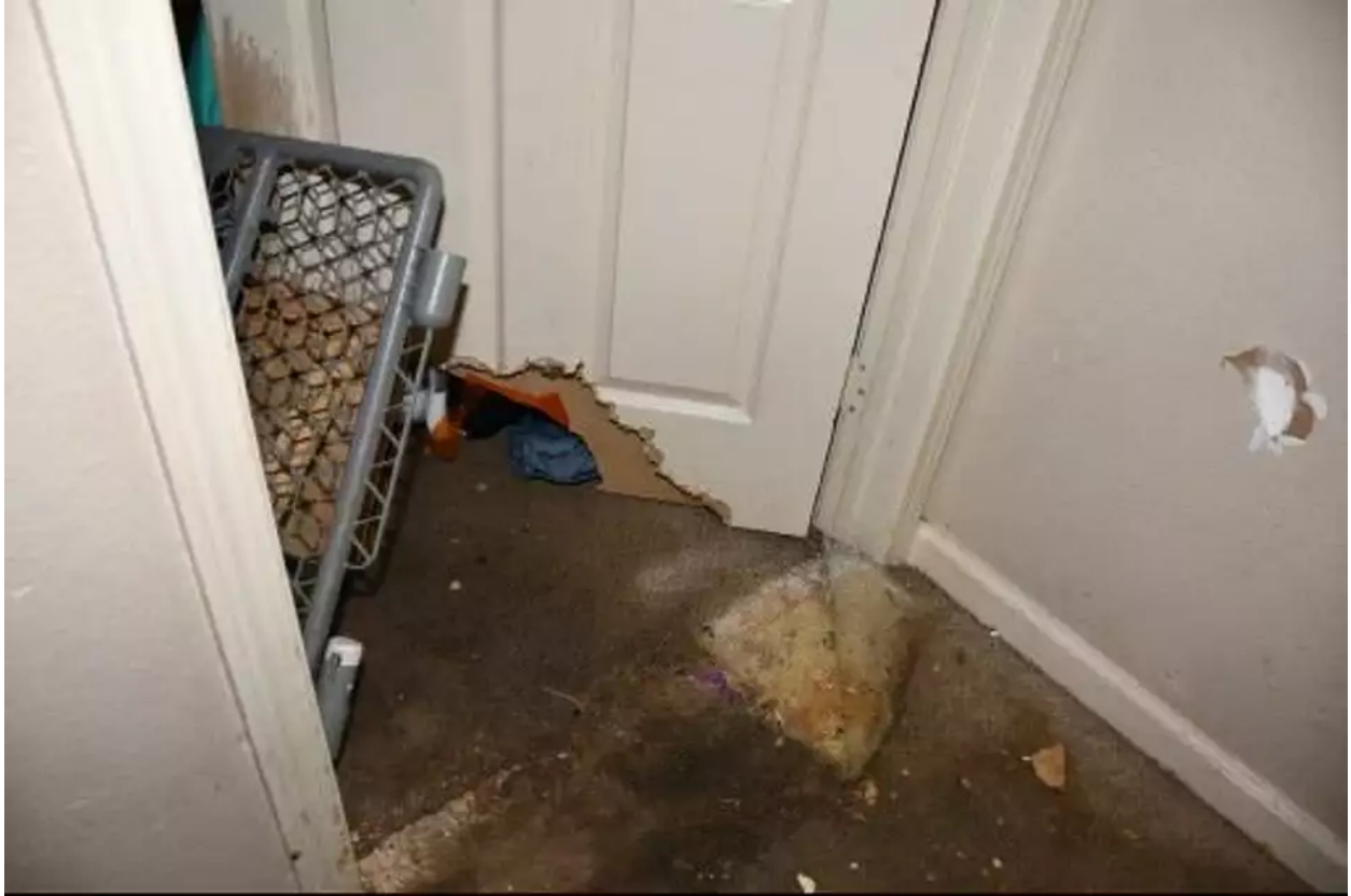
Photo shows inside of the Converse home where the baby was killed by XL bullies belonging to her babysitter. This is the door, which had been previously damaged by the dogs, the dogs broke through to attack the baby.