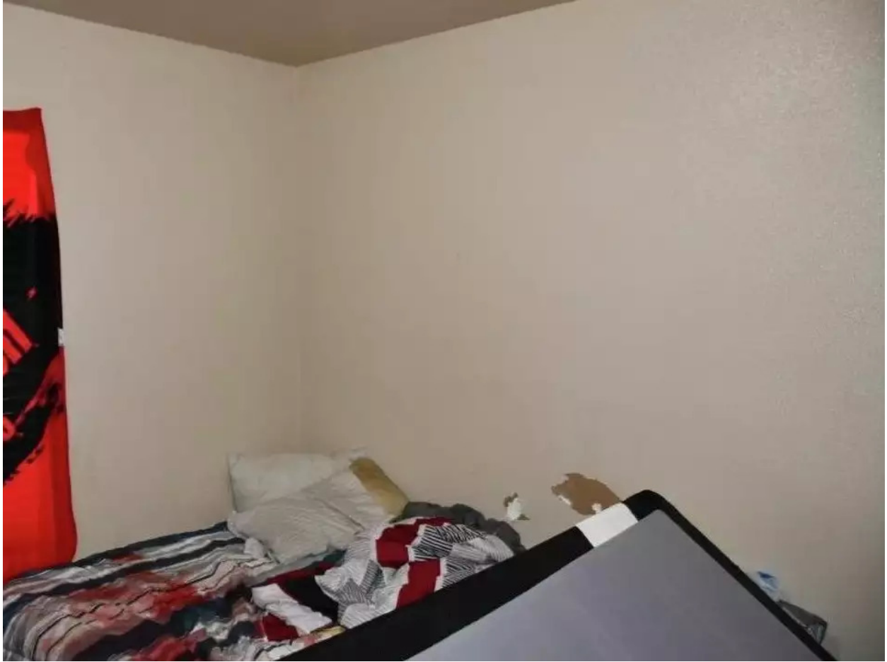
Photo shows inside of the Converse home where the baby was killed by XL bullies belonging to her babysitter. The dogs broke into the room and snatched the baby that was lying on the bed. Blood marks the spot on the bed.