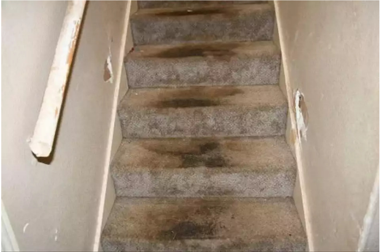
Photo shows inside of the Converse home where the baby was killed by XL bullies belonging to her babysitter. The stairs leading the room where the baby was were badly worn, damaged and soiled to the point of dilapidation.