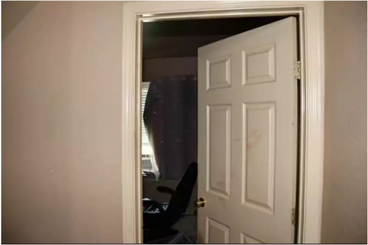
Photo shows inside of the Converse home where the baby was killed by XL bullies belonging to her babysitter. One of the doors smeared with blood. The teen ran room-to-room with the baby in her arms trying to escape the dogs.